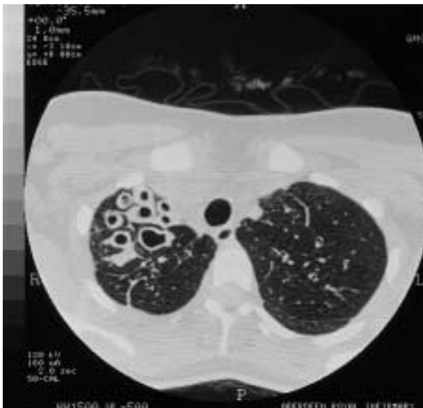
Fig. 1.—Computed tomography of the thorax showing right upper lobe ectatic bronchi with thickened walls.

The cells in the stroma were mostly lymphocytes