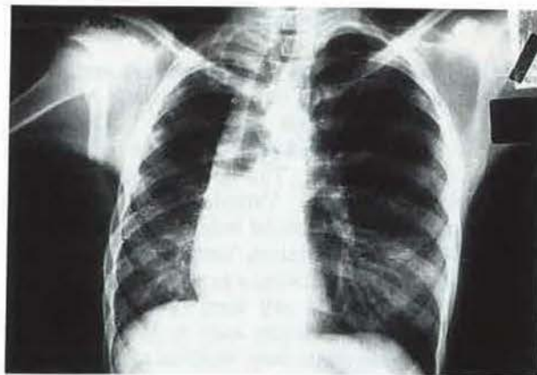
Fig. 1 - Chest X-ray film showing a loss of volume of the right lung, ipsilateral displacement and anterior herniation and hyperlucency of the left lung.

Fibreoptic bronchoscopy revealed a normal disposition of bronchi of both lungs, of normal calibre, without endobronchial lesions.