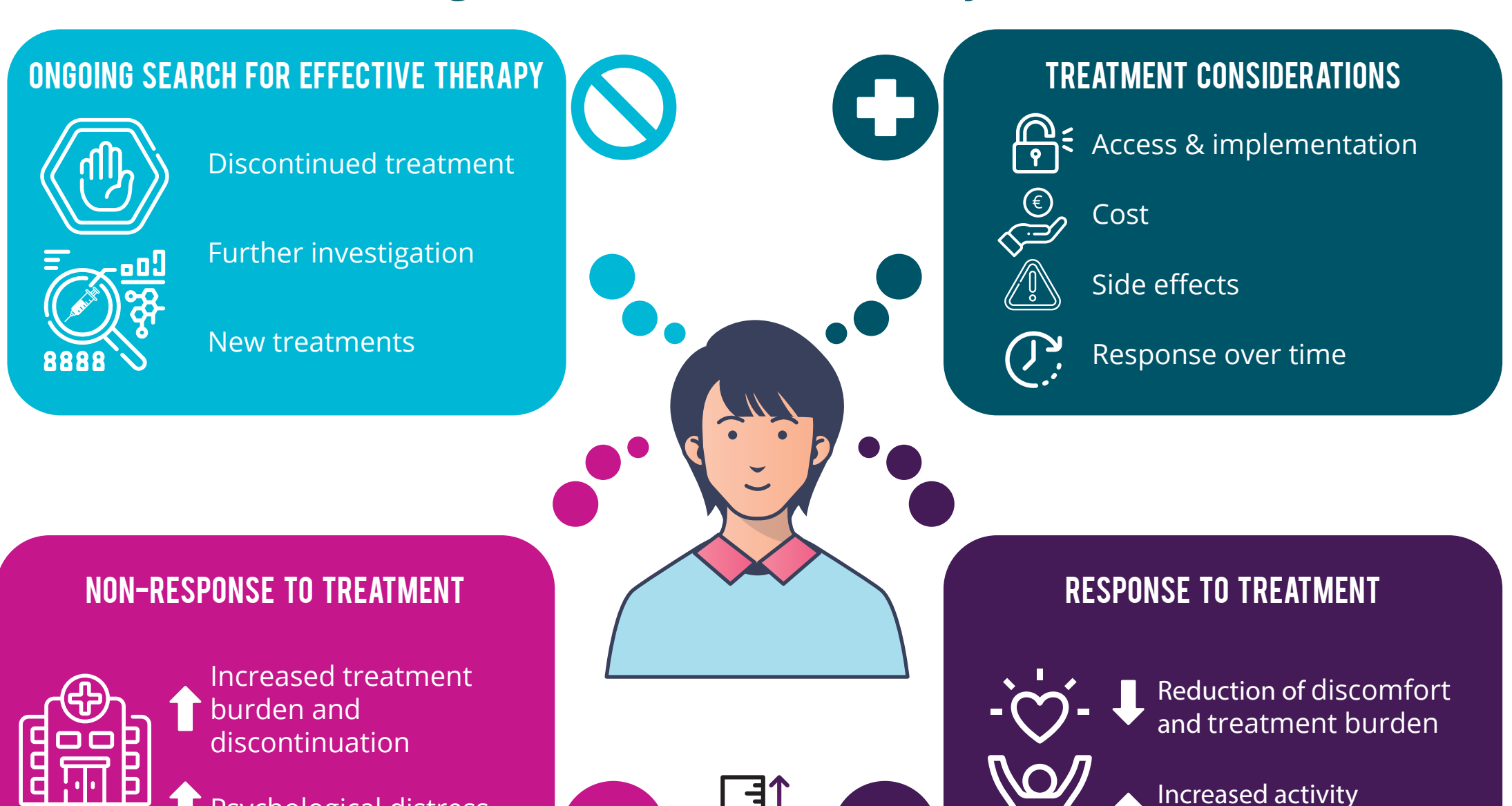
Figure 1: Patient considerations about biological therapy in severe asthma