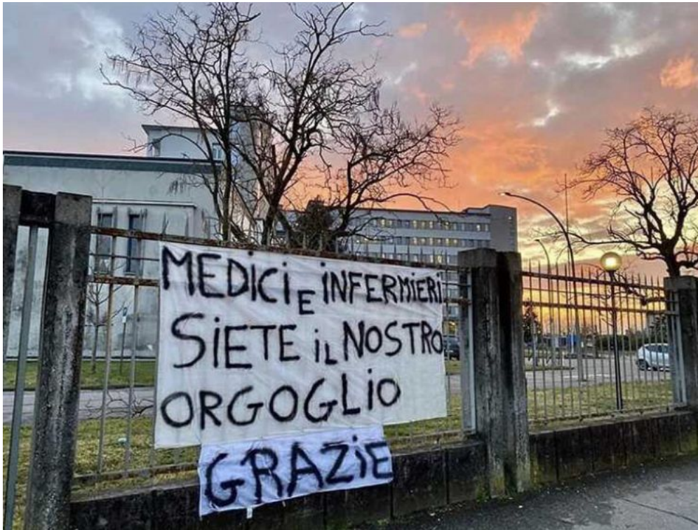
Figure 2. The Italian population understand health staff situation

("Doctors and nurses, you are our pride, thank you")