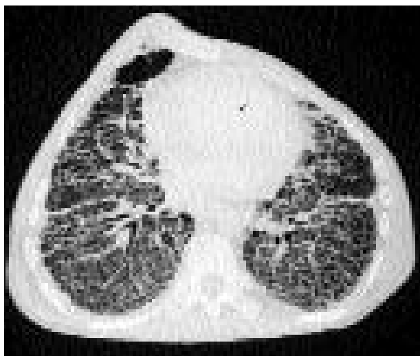
Fig. 3. – Computed tomography of the chest, showing diffuse, small reticular opacities and increase in alveolar and interstitial densities (window level -500 Hounsfield units (HU); window width 5,100 HU).

Other striking features were cholesterol clefts in the alveolar and interstitial spaces and alveolar wall-thickening with lymphocytic infiltrations (fig. 4a), which was called pulmonary interstitial and intra-alveolar cholesterol granulomas (PICG) [4]. These changes were evenly distributed throughout the entire lung and resulted in severe distortion of the native structure of the lung.