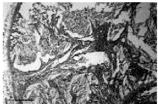
Fig. 1. – Microscopic appearance of the lung obtained by open lung biopsy at 3 yrs of age, showing severe widespread lipoid pneumonia with formation of prominent acicular cholesterol clefts. Alveolar wall-thickening with lymphocytic infiltration is also observed (Haematoxylin and eosin stain; scale bar 500 µm).

During his nursery and elementary schooling, he remained asymptomatic and was able to practise gymnastics. He began to experience dyspnoea on effort from 12 yrs of age, when he entered junior high school. Although dyspnoea progressed slowly, he was able to lead a normal daily life for the following 5 yrs. When