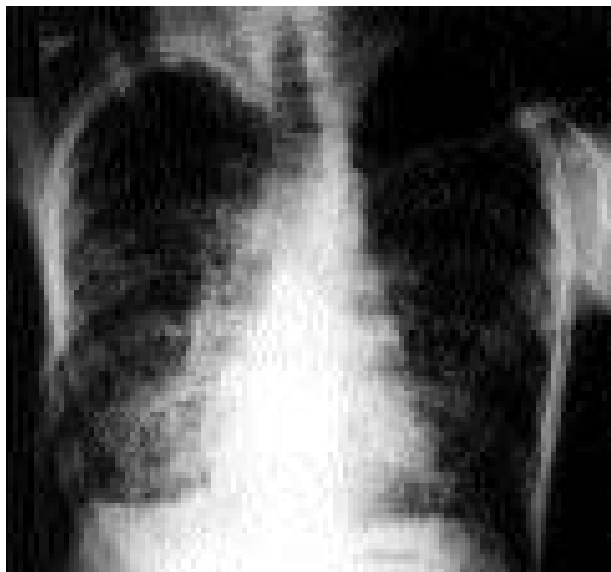
Fig. 2. – Posteroanterior chest radiograph on admission at 18 yrs of age showing diffuse reticulonodular infiltrates in the entire lung field.

Postmortem examination showed stiff, indurated lungs (right 880 g, left 680 g; normal adult lung weight 625 and 565 g, respectively) with no volume reduction. The surface of the lungs had a diffuse nodular appearance, and the cut surfaces showed diffuse fibrosis, honeycomb-like