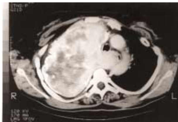
Fig. 1. – Computed tomography (CT) scan showing the solid mass that arises from the anterior part of first ribs, fills the right superior hemithorax and extends into the mediastinum, where it shifts major structures.

The surgical specimen weighed 1,500 g. The hard and partially calcified tumour arising from anterior part of the two first ribs measured 17×13×10 cm. The internal side of the tumour, covered with parietal pleura, was smooth and lobulated. Microscopically, the lesion had