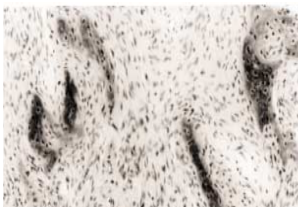
Fig. 3. – Histological appearance diagnostic of fibrous dysplasia. A dense collagen tissue with regular fibroblasts and osseous trabeculae. These trabeculae have Chinese letter shapes and are not layered by osteoblasts. (Haematoxylin and eosin stain; internal scale marker=100 \mu m).

Thoracic outlet syndrome, an unusual event resulting from fibrous dysplasia of the first ribs, has been reported previously [6, 7]. Costal lesions of fibrous dysplasia are also known to develop after the end of growth because of cystic degeneration [8], with occasional formation of an aneurysmal cyst [9]. This enlargement may mimic sarcomatous transformation [8], but malignancy occurs in less than 1% of cases of fibrous dysplasia [10].