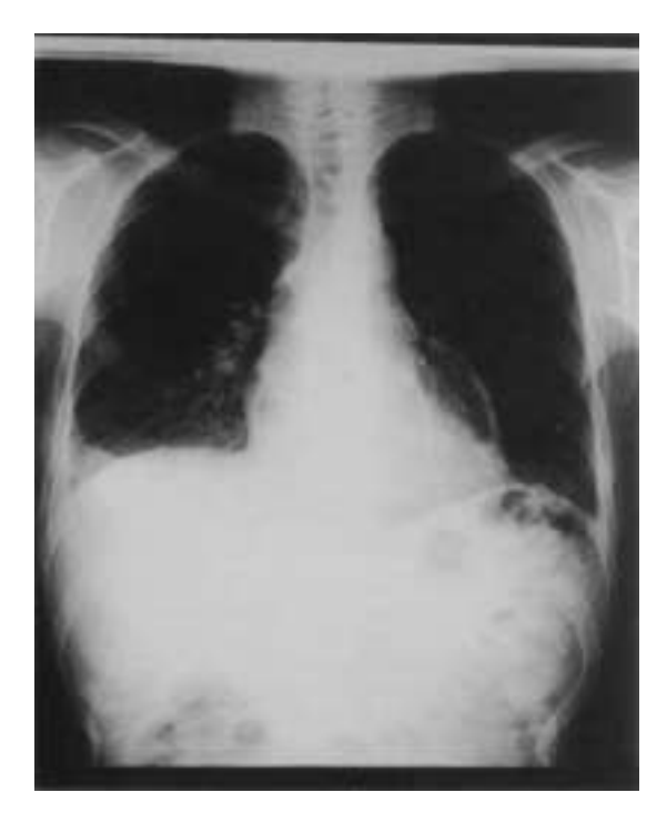
Fig. 2. – Day 27 after surgery. Pneumopericardium with air collection especially at upper left cardiac margin. No signs of pneumothorax.