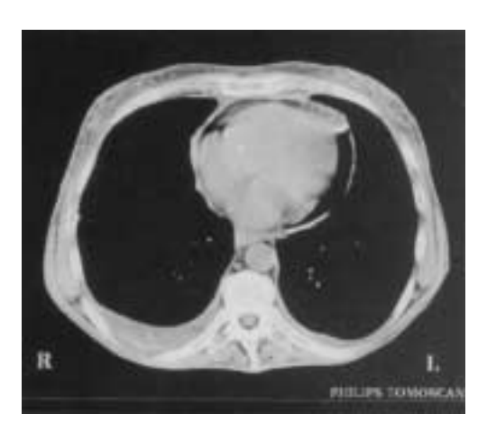
Fig. 3. - Computed tomography scan. The heart is surrounded by air within the pericardial space.

ative. Cytology of the lavage fluid and histology of transbronchial biopsies revealed some reactive changes, without specific abnormalities. The apppearance of CMV in blood, as one of the hallmarks of active infection, was monitored weekly by testing for CMV-pp65 +ve blood leucocytes ("CMV-antigenemia" [2]). In this highly sensitive and specific assay even low numbers of pp65 +ve cells are diagnostic for active CMV infection. In this patient the test was negative at the time the pneumopericardium was detected, but became positive within a few days, although only at one occasion (fig. 1). Because of this secondary CMV infection, the daily azathioprine dose was reduced from 75 mg (1.5 mg·kg<sup>-1</sup>) to 25 mg. However, the patient's condition deteriorated, accompanied by fever to 39.7°C, and moderate disturbances of