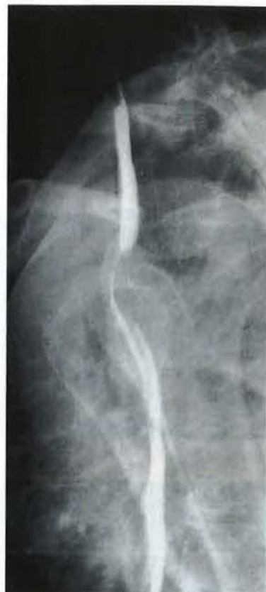
Fig. 2. - Barium swallow. Lateral view.