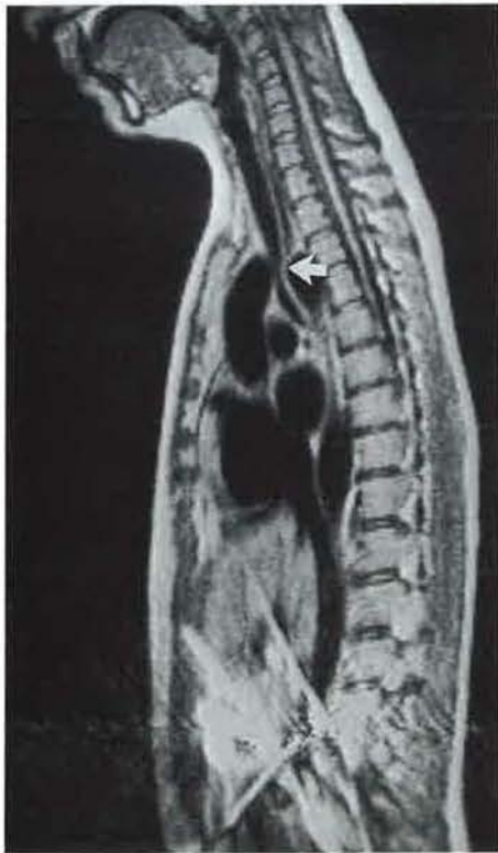
Fig. 4. - Magnetic resonance images: (upper panel) axial plane; and (lower panel) sagittal plane. Note that the trachea (arrow) is compressed between the ascending and descending aorta.