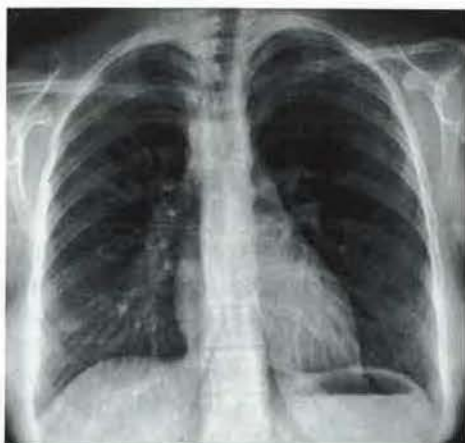
Fig. 1. - Posteroanterior chest roentgenogram.

As a young child, she was slightly troubled by breathlessness and this became more evident after the age of about 8 yrs. It was most apparent in connection with exercise and during episodes of upper respiratory infection. A chest roentgenogram from this period was interpreted as normal. Asthma medication gave no relief. Her physical capacity was poor and she was never able to run as fast as her peers. She developed the habit of sleeping with her mouth open and snored loudly.