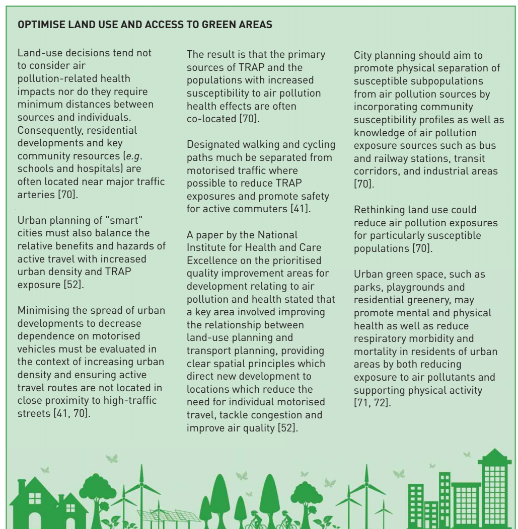
FIGURE 2 Community-level interventions. TRAP: traffic-related air pollution.

Children are, by their shorter stature, closer to the source of air pollution and have a faster respiratory rate which results in their exposure to black carbon being disproportionately high, particularly in association with transit to and from school, and at school [74]. Children's exposure can be reduced by avoiding major intersections, busy roads and queuing traffic where possible, and walking on the least trafficked side of the road [58]. Walking on the downhill side of the road (relative to traffic flow) may also help since driving uphill induces engine load, which increases emissions [75].