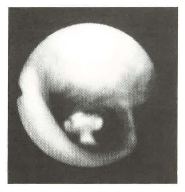
Fig. 2. - Spinhaler propeller lodged in right intermediary bronchus.

the right upper lobe bronchus (fig. 2). He was referred for removal of the spindle at rigid bronchoscopy, which was performed without complication; and he was discharged the following day.