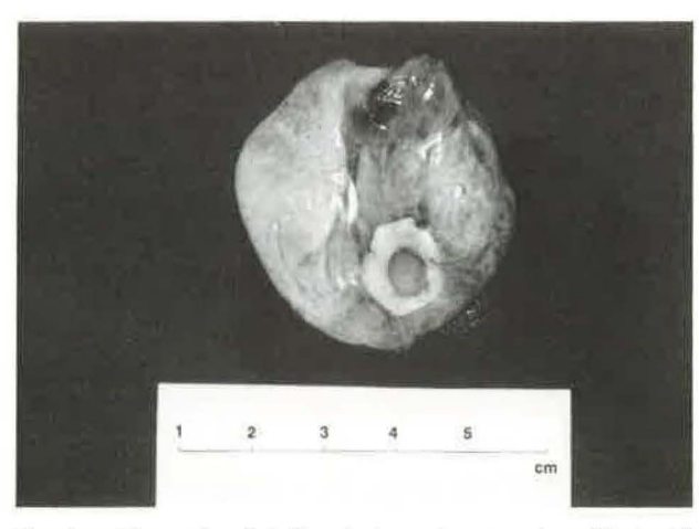
Fig. 3. – The pericardial diverticulum after resection, filled with water. The orifice to the pericardium can be seen.

Because of the recurrent complaints a right posterolateral thoracotomy was performed.