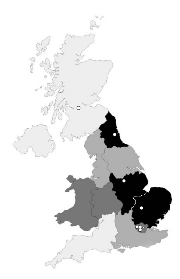
FIGURE 1. Geographic origin of referrals to the centre in Papworth (Cambridge, UK) for pulmonary endarterectomy. \bigcirc : location of specialist centres. Referral rates per 1,000,000 population, with three regions within each band: 4.9–7.6 ( \blacksquare ); 4.1–4.9 ( \blacksquare ); 3.6–4.1 ( \blacksquare ); 1.2–3.6 ( \blacksquare ).

The null hypothesis that cumulative rates were uniform across the UK was tested using the Chi-squared test, comparing observed versus expected rates. Regional rates were also