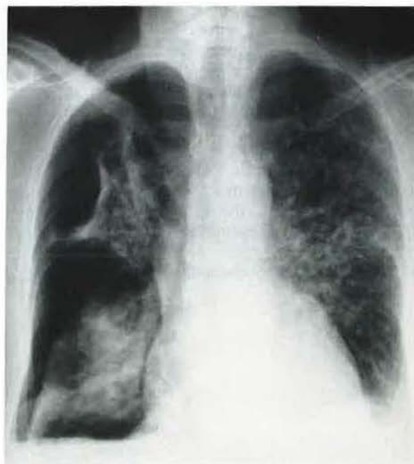
Fig. 2. - Obvious regression of the left-sided lung metastases combined with a right-sided pneumothorax following two courses of chemotherapy.