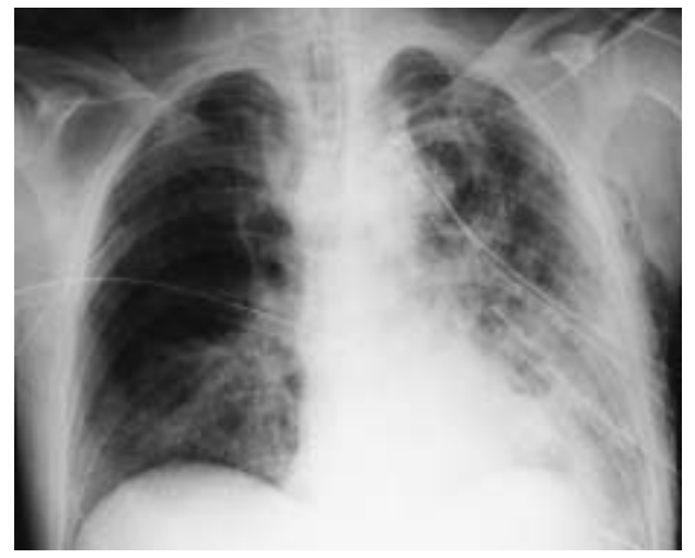
Fig. 1. – A frontal chest radiograph of the patient on arrival with six chest tubes inserted. The patient is intubated and mechanically ventilated. Pulmonary infiltrates are present.

On arrival, the patient was ventilated by a volumecontrolled ventilator, and enormous airleaks were observed