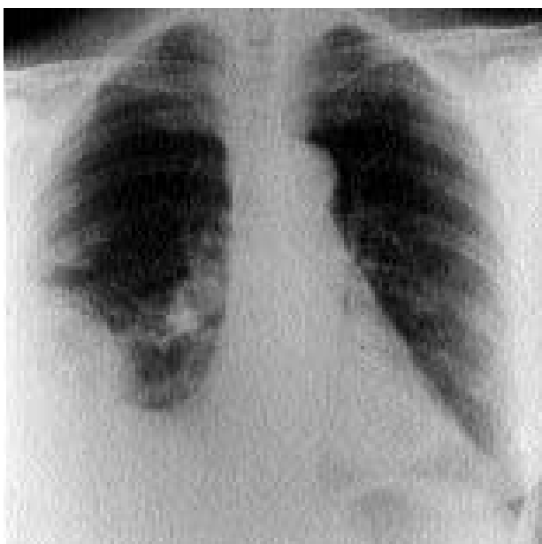
Fig. 2. – Patient 2. Infiltrates in the right upper and lower lobe caused by Staphylococcus aureus . Central infiltrate near the right hilus caused by Wegener's granulomatosis.

A 53 year old female patient had had a limited form of WG since 1991. She had signs and symptoms of upper and lower respiratory tract involvement, but no renal involvement was found. The c-ANCA titre was elevated to 1:64, and antiproteinase-3 was weakly positive. Anti-myeloperoxidase and antielastase were negative. Despite treatment with 60 mg·day -1 of prednisolone the patient developed progressive pulmonary lesions. Hence, cyclophosphamide, 150 mg daily, and trimethoprim/sulphamethoxazole, 960 mg twice daily, were added. The c-ANCA titre became negative and the pulmonary nodules resolved.