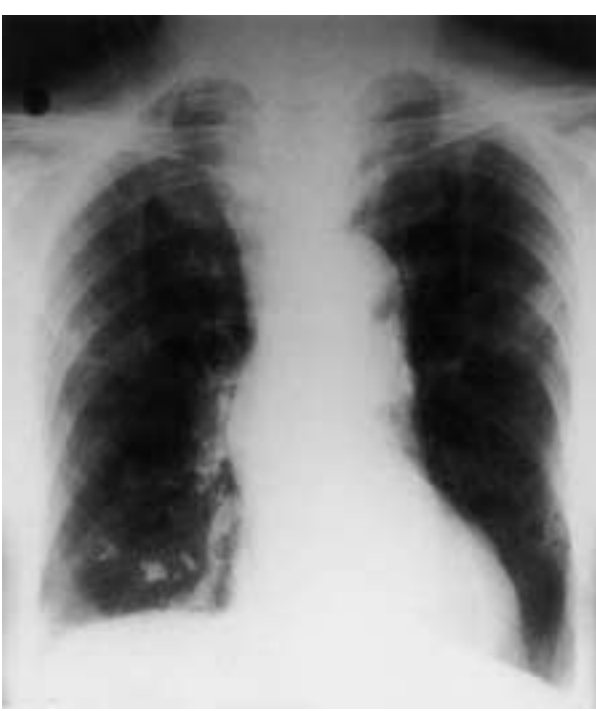
Fig. 1. – Chest X-ray, at time of admission, showing blunting of the right costodiaphragmatic sinus and calcifications in the right lower lung fields.

diaphragmatic sinus and calcifications in the right lower lung fields. These observations were identical to those made on chest X-rays performed 2 yrs previously (fig. 1). Due to the persistance of cough, a fibreoptic bronchoscopy