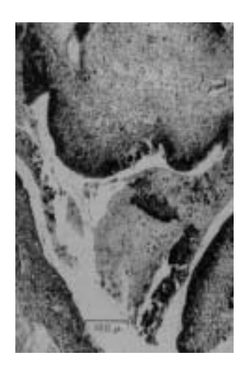
Fig. 3. – Bronchial biopsies (original magnification \times 750, H & E stain), showing necrosis of the bronchial epithelium and of the underlying membrane with brownish features suggesting the presence of ferrous pigment.

The importance of removal of the tablet (as early as possible) is confirmed by the observation of a 59 year old patient, who died of massive haemoptysis 10 days after aspiration, despite the removal of the tablet 6 days previously [6]. At autopsy, a massive necrosis of the interme-