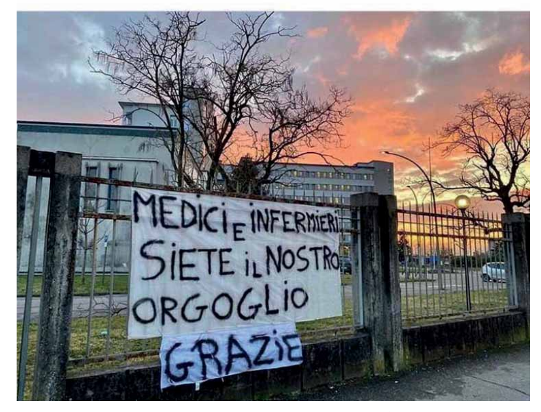
FIGURE 2 The Italian population understand the situation of healthcare staff ("Doctors and nurses, you are our pride, thank you").

number of new cases. All our staff has been strongly exhorted to use adequate personal protective equipment according to the WHO document [9], equipment that is still difficult to find due to the huge demand.