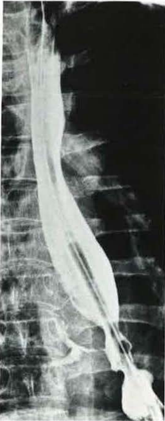
Fig. 2. - Roentgen contrast swallow of the oesophagus, showing leakage of contrast into the mediastinum and pleural cavity on the right.

After introduction of a gastric tube, much air escaped and the abdominal pain disappeared. Subsequently, a roentgen contrast swallow of the oesophagus was made (fig. 2). This showed leakage of contrast into the mediastinum and pleural space to the right.