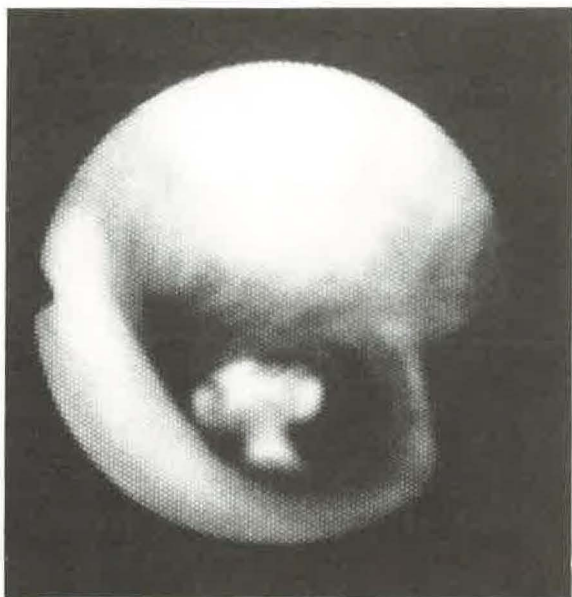
Fig. 2. - Spinhaler propeller lodged in right intermediary bronchus.

the right upper lobe bronchus (fig. 2). He was referred for removal of the spindle at rigid bronchoscopy, which was performed without complication; and he was discharged the following day.