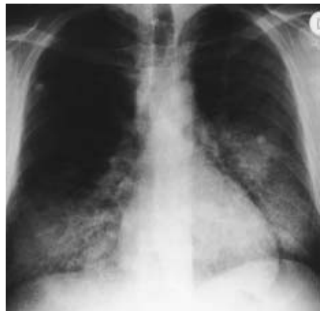
Fig. 1. – Chest radiograph on day 5 showing bilateral alveolar/interstitial infiltrates.

um creatinine 607 μmol·L -1 (normal 62–107). Liver function tests revealed: alkaline phosphatase 104 U·L -1 (normal 13–120); lactate dehydrogenase 492 U·L -1 (normal 114–235); aspartate aminotransferase (ASAT) 39 U·L -1 (normal 0–40); alanine aminotransferase (ALAT) 44 U·L -1 (normal 0–30); gamma-glutamyltransferase 395 U·L -1 (normal 0–65); and total bilirubin 17 μmol·L -1 (normal 3–26). Haemoglobin was 6.4 mmol·L -1 (9.6 on day 1), white cell count was 11.6×10 9 ·L -1 (neutrophils 75.5%, lymphocytes 13.3%, monocytes 8.3%, eosinophils 2.8% and basophils 0%). Urinalysis showed elevated red cells (15–20 per